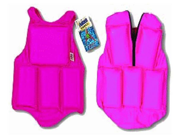
Flotation Swim Suits