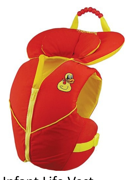
Infant Life Vest