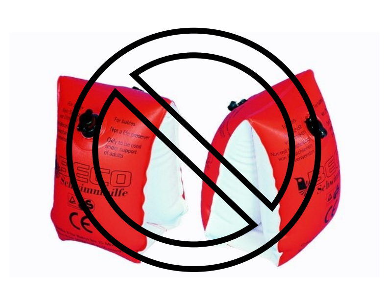
Water Wings/Arm Floaties