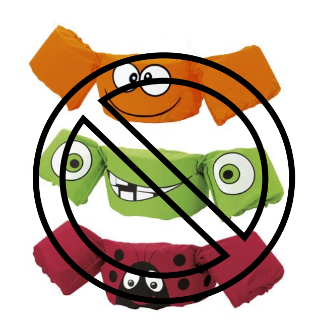
Water Wings with Belts