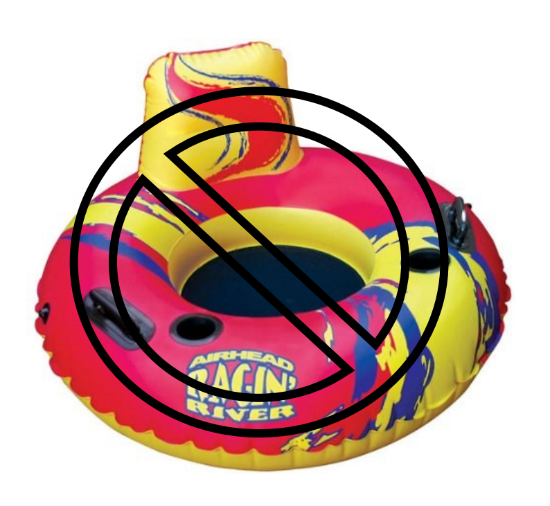
Inner Tubes with Seats