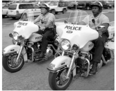
Public Safety (Auburn Police Division patrols)

Several current and upcoming projects should help address these concerns. In January, Auburn voters approved the use of proceeds from the Special Five Mill Tax Fund to provide $9 million in infrastructure and public improvements. One project approved by this measure is the Donahue Drive - Magnolia Avenue intersection improvements, now underway. Other projects expected to get underway this summer include the Magnolia Avenue resurfacing and crosswalk installation, street resurfacing, and the Frank Brown Recreation Center renovations.