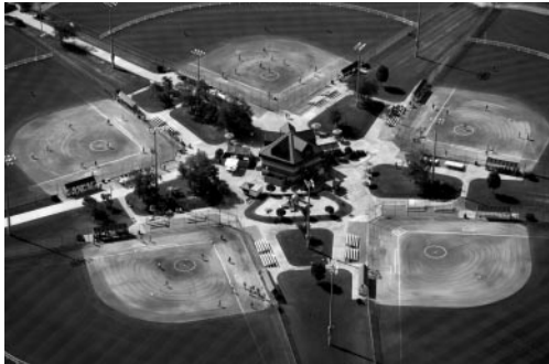
City Facilities (Auburn Softball Complex)

The 2009 Citizen Survey showed that 75% of citizens were satisfied with the value of City services they received for their tax dollars. A professional staff is an essential component to maintaining these services. The City of Auburn prides itself on employing a highly-qualified, competitively-compensated workforce while keeping personnel costs under 50% of the overall budget. Many government entities allocate up to 80% of their budget to personnel. The City's workforce includes a wealth of knowledgeable, long-term employees dedicated to their community and