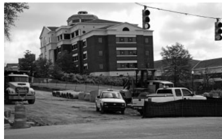
Infrastructure Improvements (Donahue Drive - Magnolia Avenue intersection improvements)