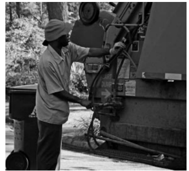
City Services (Environmental Services crew)