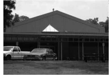
Dean Road Recreation Center

Maps highlighting the new single member wards are on display now at City Hall, 144 Tichenor Avenue; the Auburn Public Library, 749 East Thach Avenue; Boykin Center Gymnasium, 400 Boykin Street; the Frank Brown Recreation Center, 235 Opelika Road; the Dean Road Recreation Center, 307 South Dean Road; the Development Services Building, 171 North Ross Street; and the Bailey-Alexander Complex, 1501 West Samford Avenue. A ward map is also available on the City's web site at www.auburnalabama.org/wards .