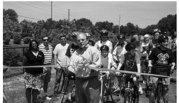
Mayor Bill Ham and members of the Auburn Bicycle Committee, along with Auburn bicycle enthusiasts, cut the ribbon at the Wire Road Bikeway Grand Opening in May.

The East University Drive multi-use path covers approximately 1/2 mile and completes another portion of the City's Master Bike Plan. Currently, the City of Auburn has over 30 miles of bike lanes with the Master Bike Plan calling for 115 miles of bike lanes within the City limits. In May, the City celebrated the grand opening of the Wire Road bike path, an off-road path running along Wire Road from Cox Road to Talheim Road. The path is approximately 1 1/2 miles in length with future plans to tie into Auburn's Kiesel Park.