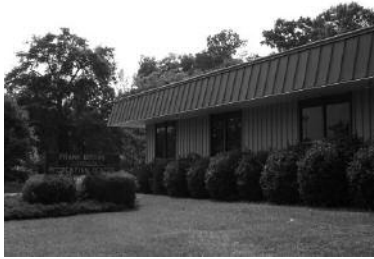
Frank Brown Recreation Center

The designated polling places for voters that reside within the City limits of Auburn are as follows: