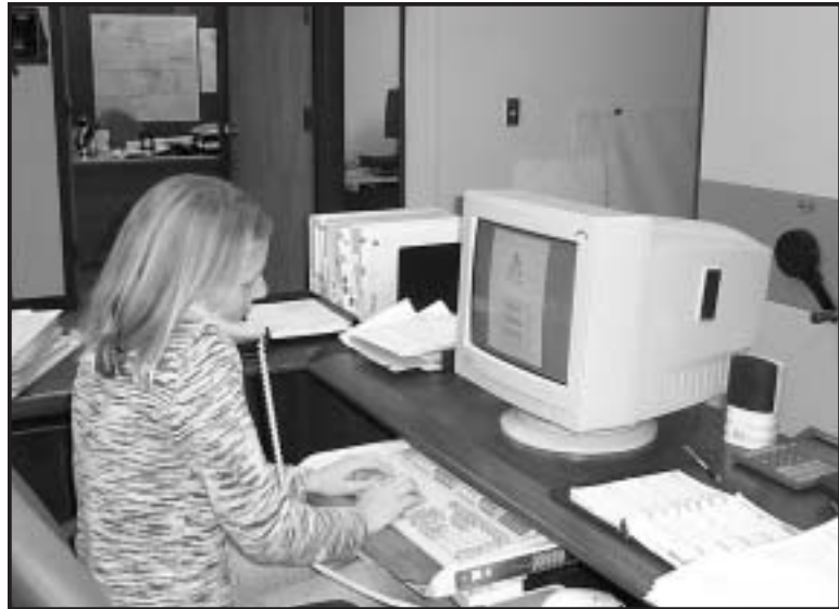
Surveyors conducting the City's annual citizen survey enter responses into the computer as they conduct the survey.