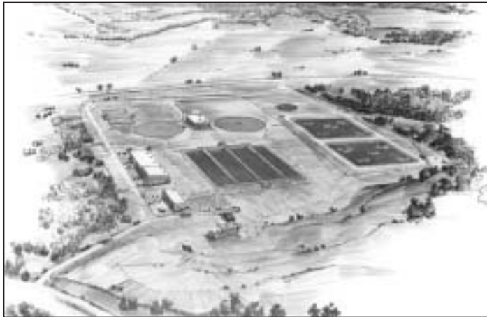
H.C. Morgan Wastewater Treatment Plant